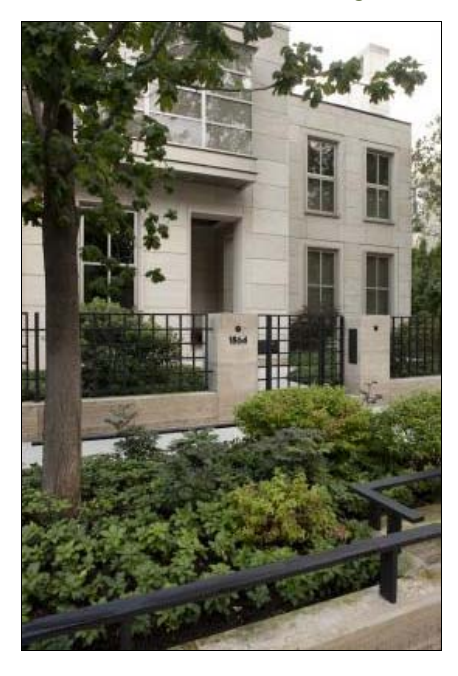
Hoerr Schaudt Garden in Chicago's Lincoln Park